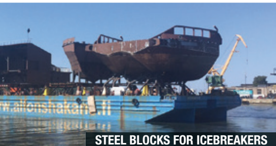
STEEL BLOCKS FOR ICEBREAKERS