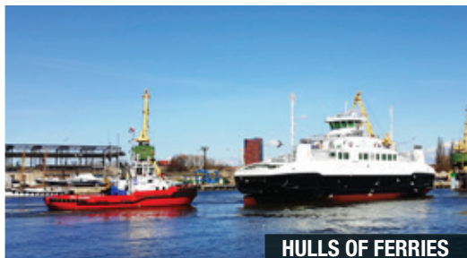
HULLS OF FERRIES