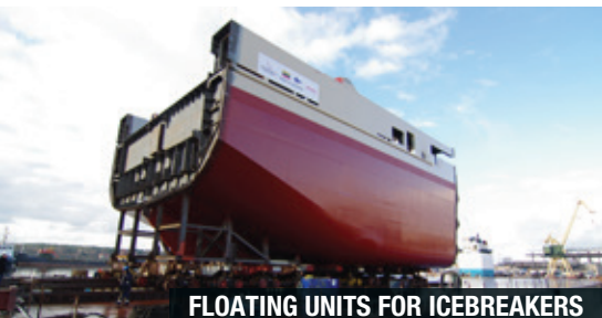
FLOATING UNITS FOR ICEBREAKERS