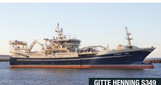
GITTE HENNING S349