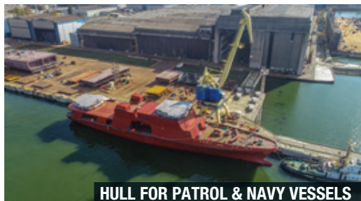
HULL FOR PATROL & NAVY VESSELS