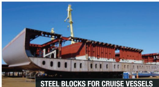
STEEL BLOCKS FOR CRUISE VESSELS